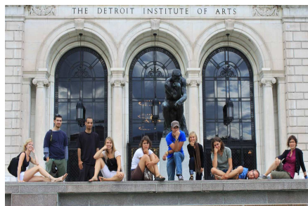
Tracking the Tar Sands: Tri-City Youth Tour Delegation (Detroit, USA)

As part of these innovative organizing initiatives, ten young people from Ontario traveled together from August 20-22 nd to Sarnia, Detroit and Windsor as participants in Tracking the Tar Sands: Tri-City Youth Tour . This initiative was organized by the Polaris Institute and the Sierra Youth Coalition with the support of Environmental Defence-Sarnia, Sierra Club Detroit Environmental Justice Program, Friends of the Detroit River, Detroiters Working for Environmental Justice, Canadian Auto Workers Windsor Regional Environment Council, and Toxic Free Canada-Ontario. Participants heard from community organizers as well as oil industry representatives, and took part in exposure tours of local industrial facilities. The following report provides a brief overview of the connections these three cities have to the tar sands developments, 2 highlights local environmental justice initiatives, and offers critical insights into the perspectives of participants and community members with whom they met.